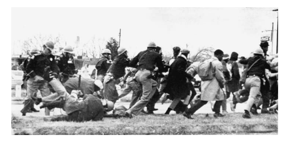
5 Negroes and State Troopers Alike Fell to the Ground in Selma, Alabama , March 7, 1965.

on race, the media could not assuage the racial anxieties of whites without affecting the depiction of blacks. So, for example, the determined efforts of the white press to frame the civil rights movement as nonthreatening had the collateral result of casting blacks in roles of limited power. With great regularity, iconic photographs show white actors exercising power over blacks—dignified black schoolchildren silently suffering the jeers of unruly mobs, well-mannered black students at lunch counters weathering the abuse of mirthful white crowds, and stoic protestors buckling under the assaults of water jets and police dogs. The chapters that follow will make this general claim historically concrete, but here it is enough to acknowledge that most of the photographs that northern whites deemed representative of the struggle showed whites in charge. If, as many scholars of the civil rights era have claimed, photographs of the struggle helped advance social and legislative change, such photographs also limited the extent of reform from the start. To the degree that narratives illustrating white power over blacks helped make the images nonthreatening to whites, the photographs impeded efforts to enact—or even imagine—reforms that threatened white racial power.