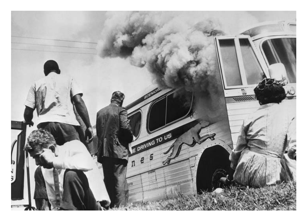
2 Joseph Postiglione, Firebombed Freedom Riders' Bus Outside Anniston, Alabama , May 14, 1961. © Bettmann/CORBIS, Seattle, Washington.

their bravery in the face of state-sponsored aggression—they consistently framed the story as a narrative of spectacular violence.<sup>4</sup>