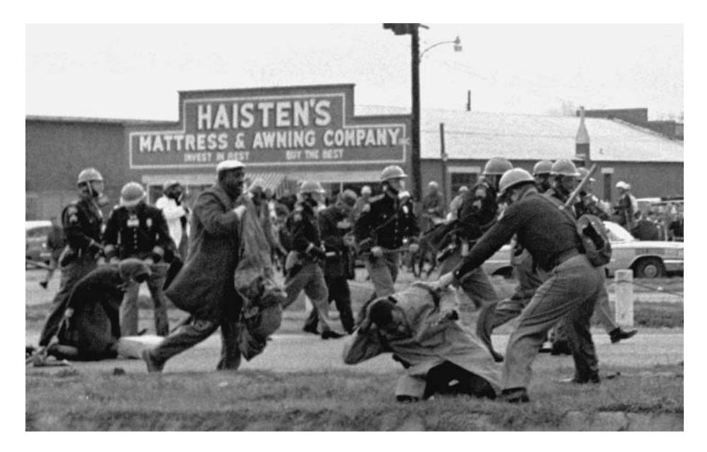
1 State Troopers Swing Billy Clubs to Break Up Civil Rights Voting March in Selma, Alabama , March 7, 1965.

Copyright © 2011. University of California Press. All rights reserved